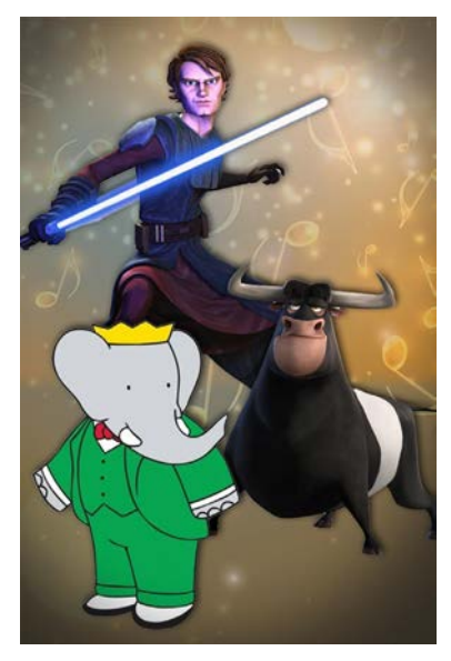
Babar, Ferdinand & Skywalker

Saturday, March 11, 2023, 1:00 P.M. Venue: Maxwell Hall at Memorial United Methodist Church